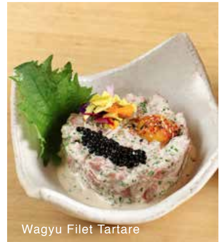
Wagyu Filet Tartare