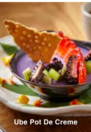
Ube Pot De Creme

Green Tea Tart with Macerated Raspberries