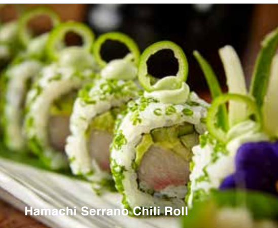
Hamachi Serrano Chili Roll

Warm Valrhona Chocolate Cake with Vanilla Bean Ice Cream