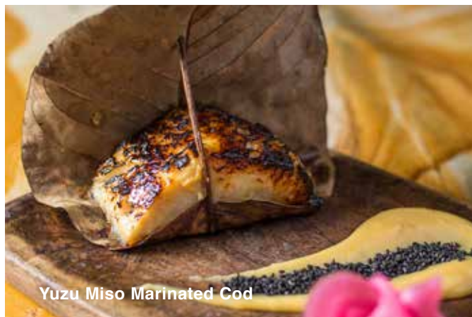
Yuzu Miso Marinated Cod