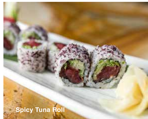
Spicy Tuna Roll

Menu is served family style. Vegetarian, Vegan, and Gluten Free menus available upon request. Items subject to change based on seasonal availability.