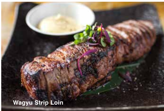
Wagyu Strip Loin