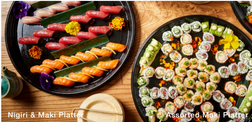
Nigiri & Maki Platter