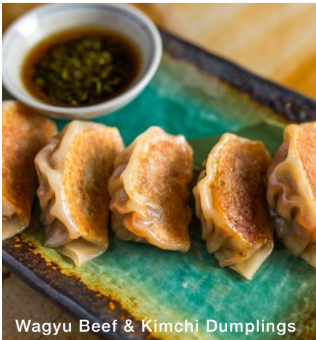
Wagyu Beef & Kimchi Dumplings