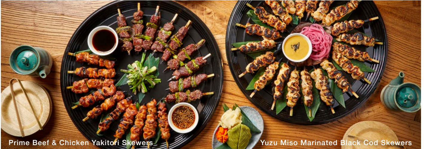
Prime Beef & Chicken Yakitori Skewers