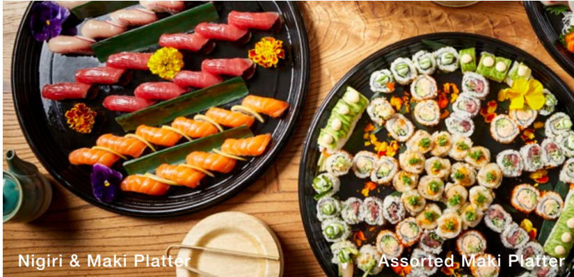
Nigiri & Maki Platter