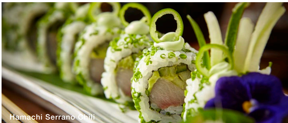
Hamachi Serrano Chili