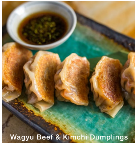
Wagyu Beef & Kimchi Dumplings